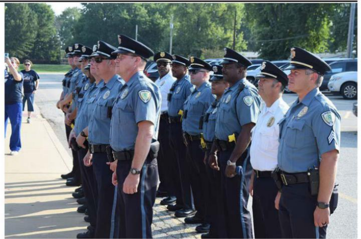
11. The school held a moment of silence, followed by a singing of "God Bless America." Officers spent time visiting with students following the ceremony.