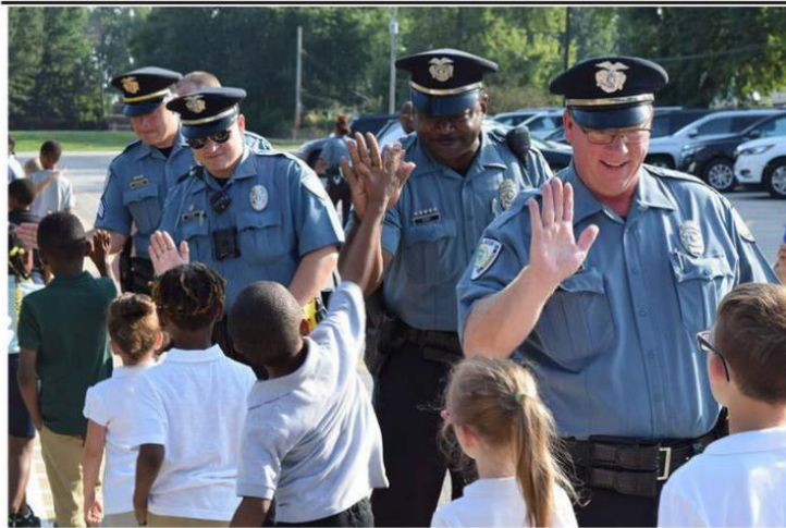
REMEMBER 9/11: Students and staff at Lusher Elementary School in the Hazelwood School District joined together with officers from the Florissant Police Department to remember the events of 9/11 on Wednesday, Sept.